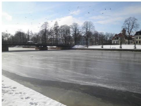
"Winter in town", by David J, is licensed under CC BY 2.0

L: Licence (what licence is used, e.g. CC BY)